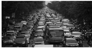
A long journey