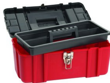
Toolbox w/Tote Tray. No Date.